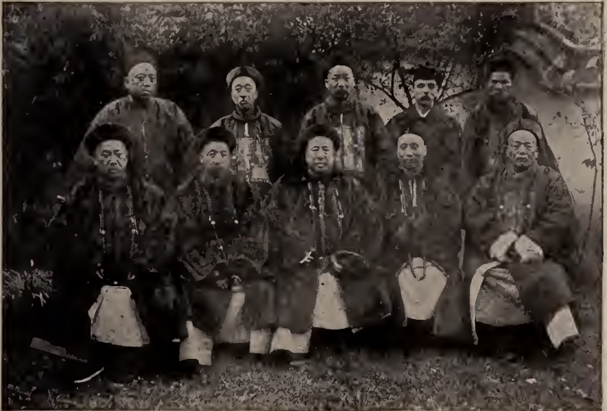
GROUP OF CHINESE OFFICIALS PRESENT AT THE COMMENCEMENT.